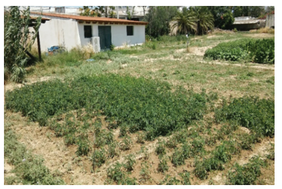
Picture 3 (left) & 4 (right). Processing tomato field at 42 and 82 days after transplanting, respectively

fruit firmness is negatively correlated with the increase of nitrogen content in fruits (Knee, 2002). As shown in Table 3, there were no correlations between fruit yield and the quality parameters.