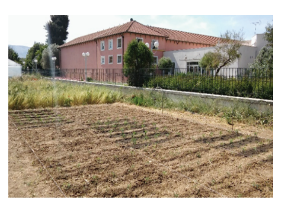
Picture 1 (left) & 2 (right). Processing tomato field at 10 and 20 days after transplanting, respectively