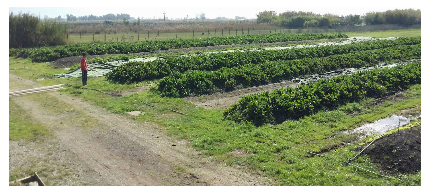
Biocyclic Park in Kalamata, Greece, where the first ever biocyclic humus soil was produced. The windrows are planted with beetroots.

contribution to the enhancement of soil life. Through the deliberate use of large quantities of humus soil, on the basis of using purely plant-based composts, biocyclic-vegan farming can also be a means to terminate and reverse the degradation and erosion of soils.