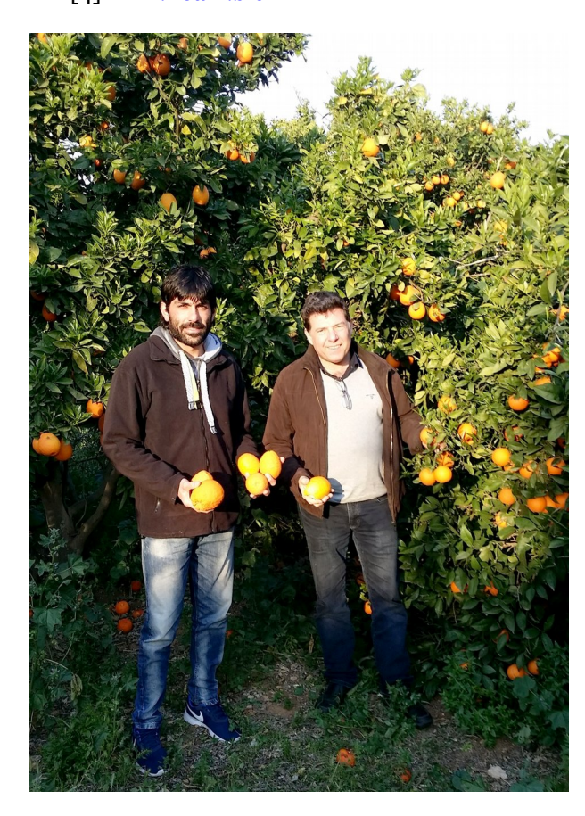
Biocyclic-vegan cultivation of Jaffa oranges in Cyprus. Apart from orange trees the orchard has plenty of other trees different from the main culture in order to increase biodiversity within the cultivated area.