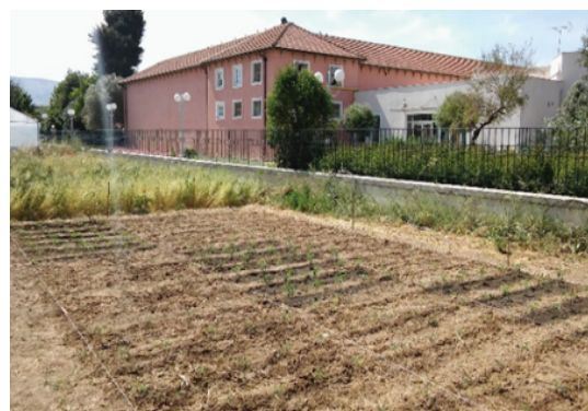
Picture 1 (left) & 2 (right). Processing tomato field at 10 and 20 days after transplanting, respectively