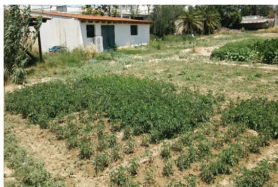
Picture 3 (left) & 4 (right). Processing tomato field at 42 and 82 days after transplanting, respectively

fruit firmness is negatively correlated with the increase of nitrogen content in fruits (Knee, 2002). As shown in Table 3, there were no correlations between fruit yield and the quality parameters.